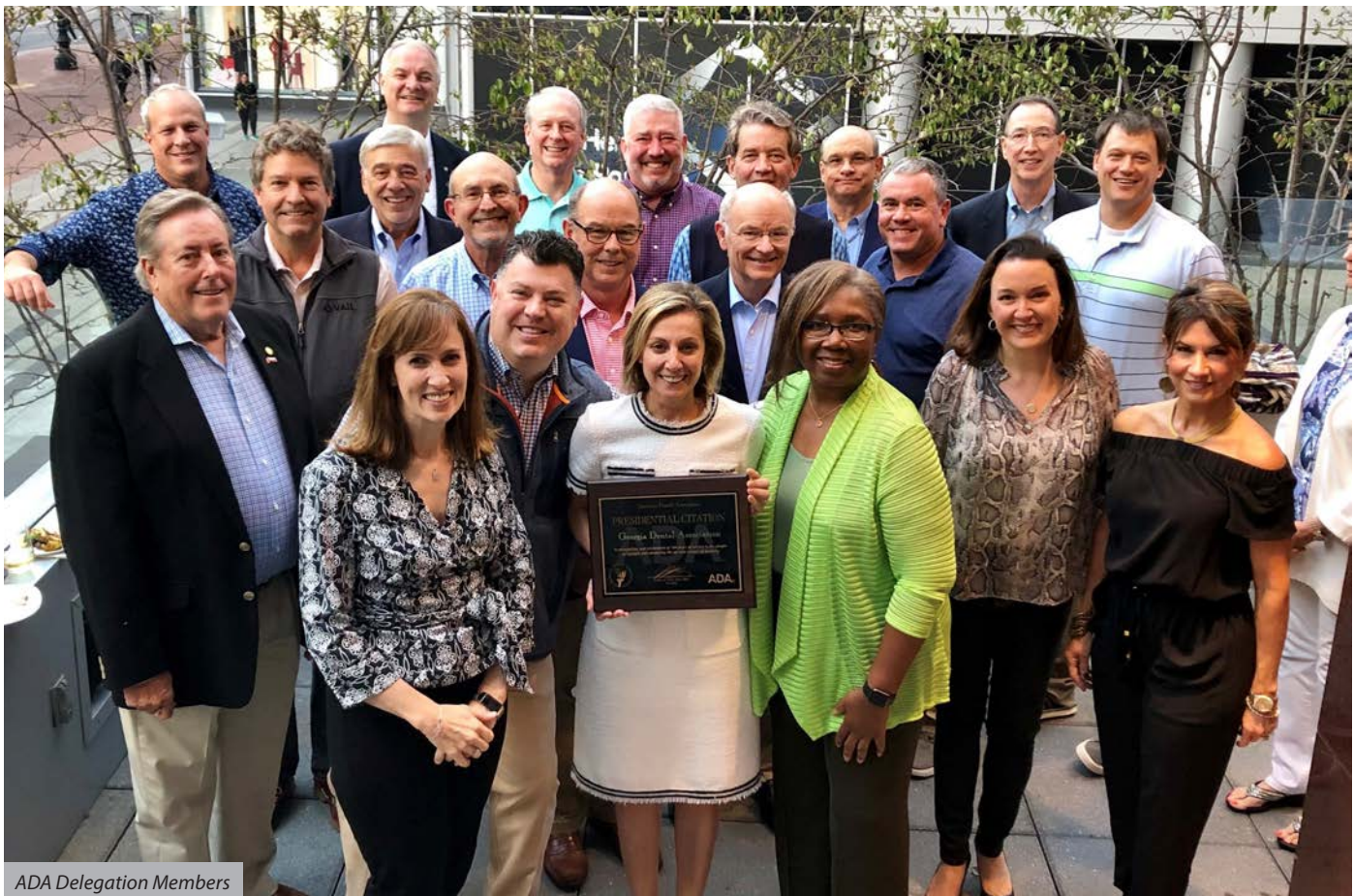
ADA Delegation Members